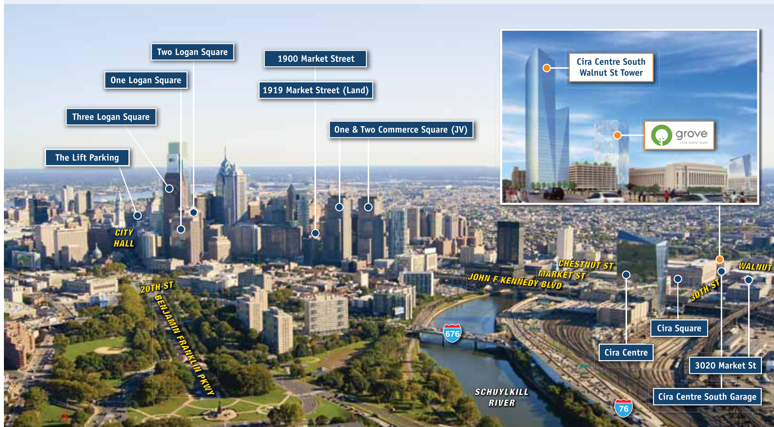
Brandywine Realty Trust Philadelphia Central Business District Portfolio