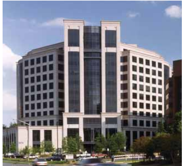
1676 International Drive, McLean, VA

As 2013 advances, we're paying close attention to economic indicators—looking toward a slow rate of recovery marked by moderate GDP growth and a moderately positive uptick in new jobs. We anticipate strong tenant activity levels, a year-end occupancy level of 90%, and very strong same-store numbers. We plan for continual reductions in our cost of debt capital as we simultaneously reduce our floating rate exposure and lengthen our debt maturity profile. We will continue on our path as a net seller. We will remain committed to ensuring that we realize optimal value for every piece of real estate—land or buildings—that we own.