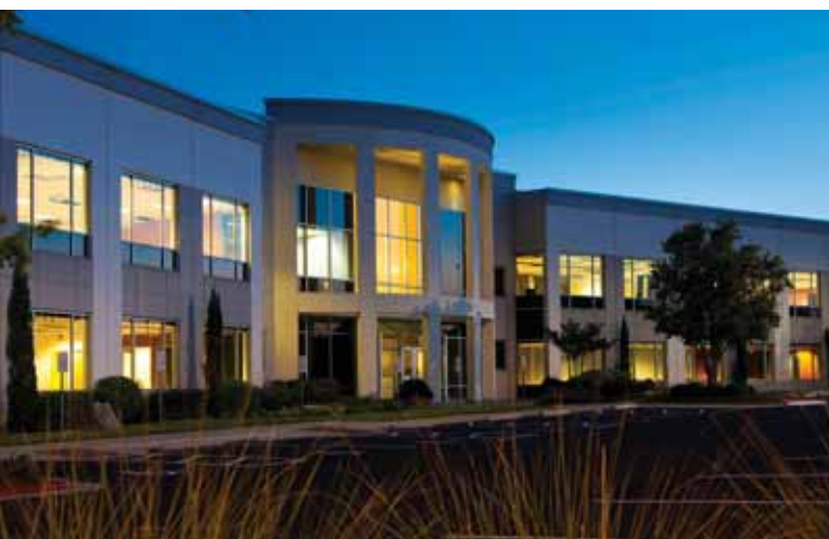
7000 West at Lantana, Austin, TX

Markets change, as do tenant priorities. In the last five years, we've managed our New Jersey portfolio down to just 5.5% of our overall company revenues from 31.1% while building a Philadelphia portfolio to 24.2% from 11.7%. We've been bold in our pursuits and successful in our drive for greater value. We have recognized the imperative of anticipating new real estate needs and intelligently accommodating them. Analytics and imagination matter. Both are core at Brandywine.