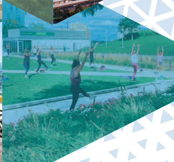
From top to bottom (L to R): Terrace with pool at shared lifestyle club at 3025 JFK, Philadelphia, PA; commuter parking her bike on Market Street, Philadelphia, PA; facade of the Bulletin Building; outdoor common area at 650 Park, King of Prussia, PA; Skyrise at Uptown ATX, Austin, TX; a team working in FMC Tower, Philadelphia, PA; fitness class on Cira Green