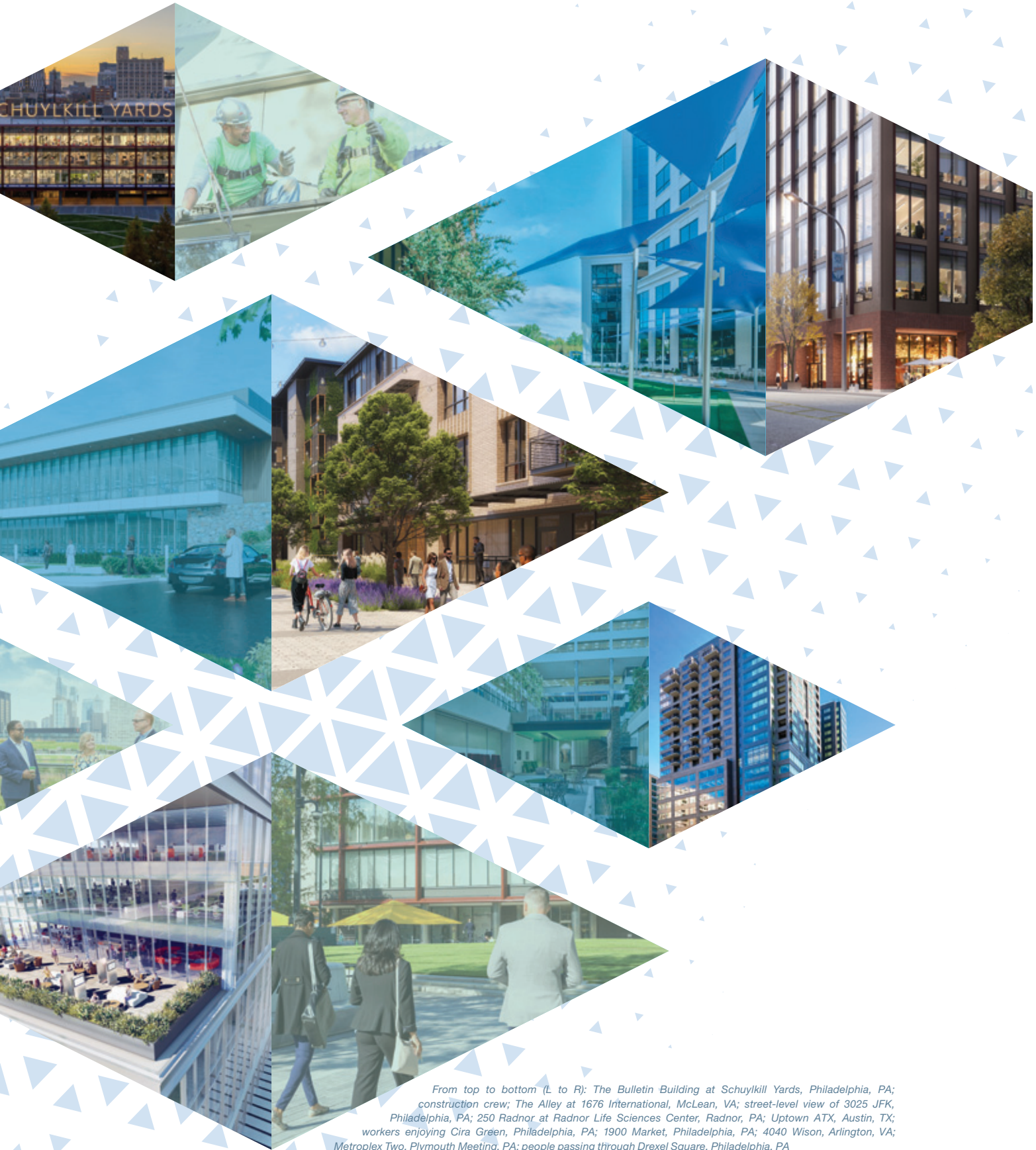
From top to bottom (L to R): The Bulletin Building at Schuylkill Yards, Philadelphia, PA; construction crew; The Alley at 1676 International, McLean, VA; street-level view of 3025 JFK, Philadelphia, PA; 250 Radnor at Radnor Life Sciences Center, Radnor, PA; Uptown ATX, Austin, TX; workers enjoying Cira Green, Philadelphia, PA; 1900 Market, Philadelphia, PA; 4040 Wilson, Arlington, VA; Metroplex Two, Plymouth Meeting, PA; people passing through Drexel Square, Philadelphia, PA